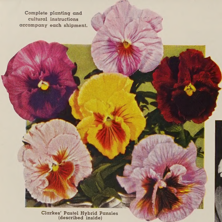
Clarks' Pastel Hybrid Pansies (described inside)

Complete planting and cultural instructions accompany each shipment.